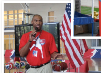
Army National Guard Basketball