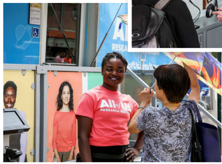
National Institutes of Health, All of Us Research Program